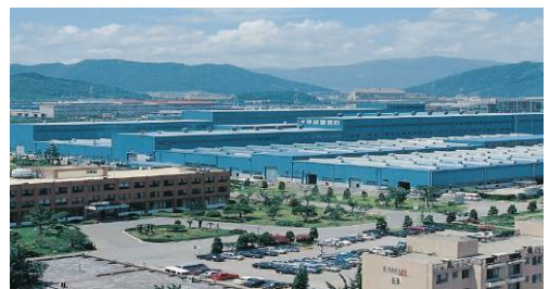
Overview of HICO Factory in KOREA